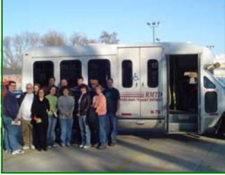
Class 3 with the latest completed class project: RIDE Mass Transit

For the last three months Class 3 has been busy learning about our community.