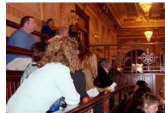
Visiting the Senate