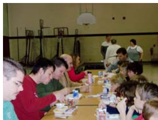
Class 3, eating breakfast at Washington Grade School